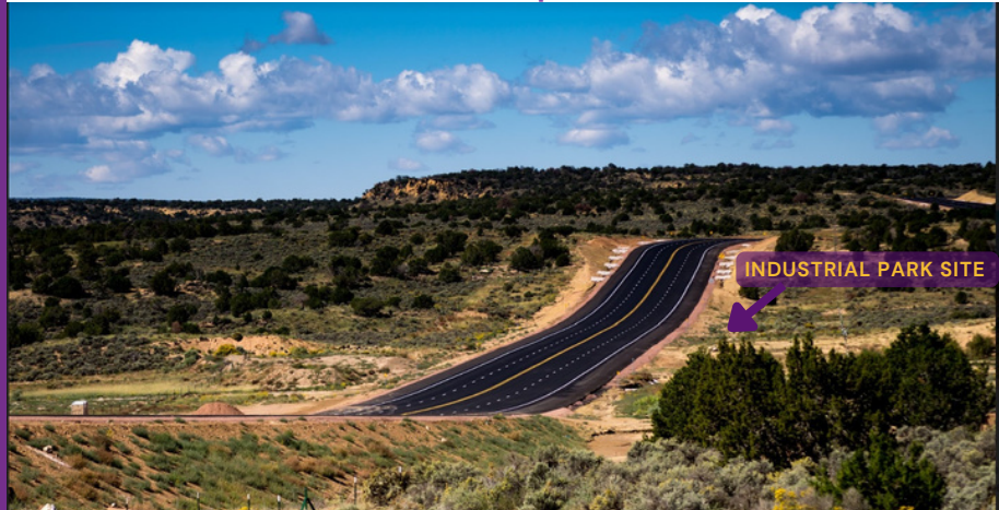
Site located north of recently opened Carbon Coal Road, a 5 mile 4-lane highway, connecting US Highway 491 with McKinley County Industrial Park and Gallup Energy Logistics Park.