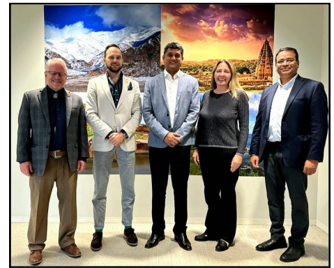
The NM Partnership delegation met with representatives from the Consulate of Turkey