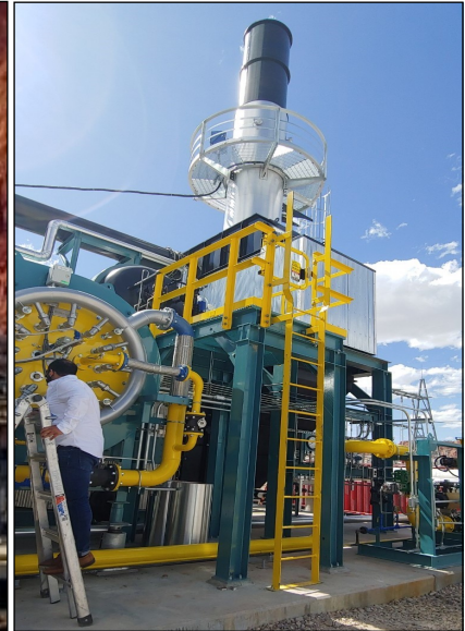
Escalante Generating Station closed at the end of 2019 (Escalante, left). McKinley Paper Co. depended on Escalante for steam. Near the end of 2020, GGEDC helped McKinley Paper obtain a $5M LEDA grant from the NM Economic Development Department to remain in operation and to save 125 jobs. (LEDA-funded boiler, right)