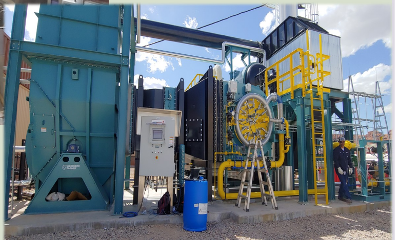
Below: Calibration underway on the first firing up of the new boiler McKinley Paper acquired with LEDA funds from NMEDD.