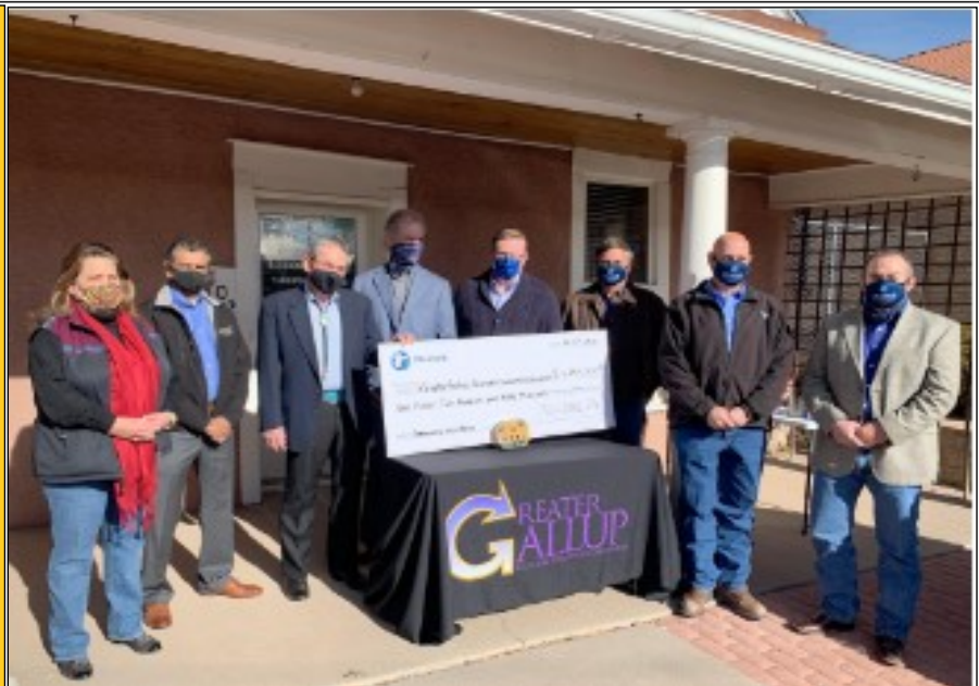
Greater Gallup EDC receives a $1.25 million donation from Tri-State Generation & Transmission Association to support economic development in McKinley County