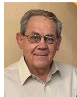
Louie Bonaguidi Mayor City of Gallup