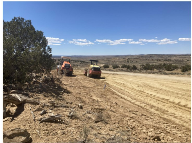
Construction of Carbon Coal Road is underway!

To date, Gallup Land Partners, LLC (GLP) has donated 159 acres of real estate to McKinley County to spur economic growth in the region. The donation included the 250-foot wide right of way to pave Carbon Coal Road between US Hwy 491 and Gallup Energy Logistics Park that will save 20 miles off the round trip to the Four Corners / San Juan Basin. Gallup Energy Logistics Park is a 21,000 linear foot, BNSF-certified rail facility. The Carbon Coal Road bypass will also reduce traffic at US 491 and I-40, but also pull truck traffic away from the Mentmore residential area.