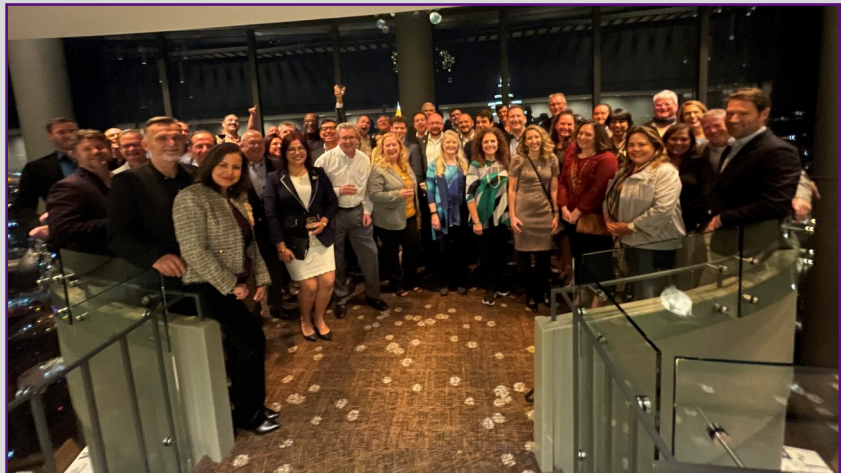
Gathering of 2021 TBIC Annual Conference attendees in Atlanta, GA