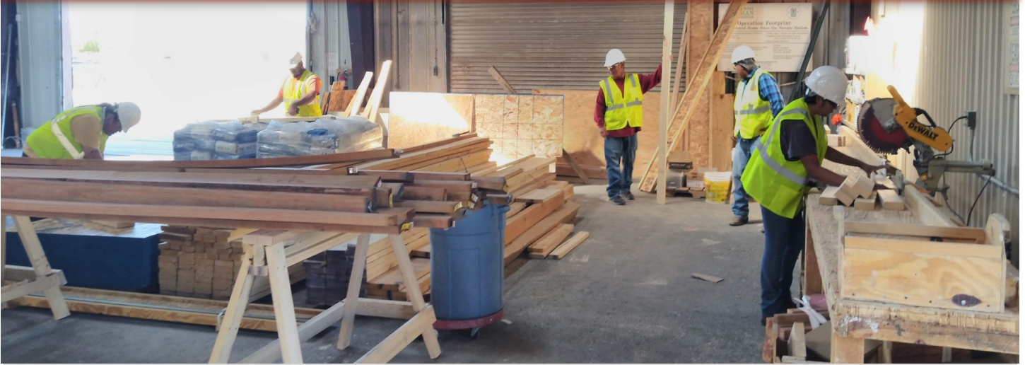
Southwest Indian Foundation (SWIF) instructs GGIWP participants in GGIWP classes 4 & 5