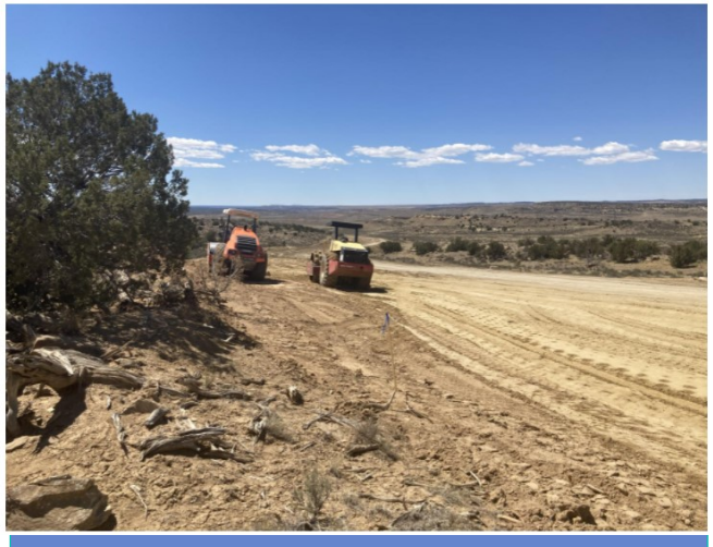
Construction of Carbon Coal Road is underway!

To date, Gallup Land Partners, LLC (GLP) has donated 159 acres of real estate to McKinley County to spur economic growth in the region. The donation included the 250-foot wide right of way to pave Carbon Coal Road between US Hwy 491 and Gallup Energy Logistics Park that will save 20 miles off the round trip to the Four Corners / San Juan Basin. Gallup Energy Logistics Park is a 21,000 linear foot, BNSF-certified rail facility. The Carbon Coal Road bypass will also reduce traffic at US 491 and I-40, but also pull truck traffic away from the Mentmore residential area.