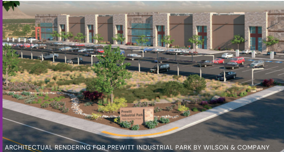
ARCHITECTUAL RENDERING FOR PREWITT INDUSTRIAL PARK BY WILSON & COMPANY